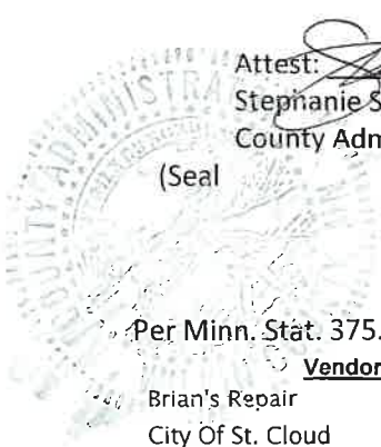
Exhibit A Warrants and Bills

Per Minn. Stat. 375.12, the number of claims totaling $2,000 or less were 83, amounting to $38,263.80.